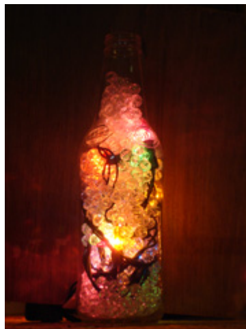
12oz bottle with multi colored lights and approx. 500 8mm faceted crystal beads.