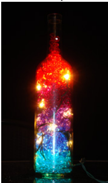
750ml bottle with clear lights and approx. 650 beads.