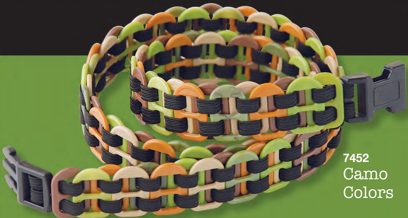
7452 Camo Colors

Kits Contains: 89 pop tabs, 3 yds. elastic cord, 1 craft buckle, instructions.