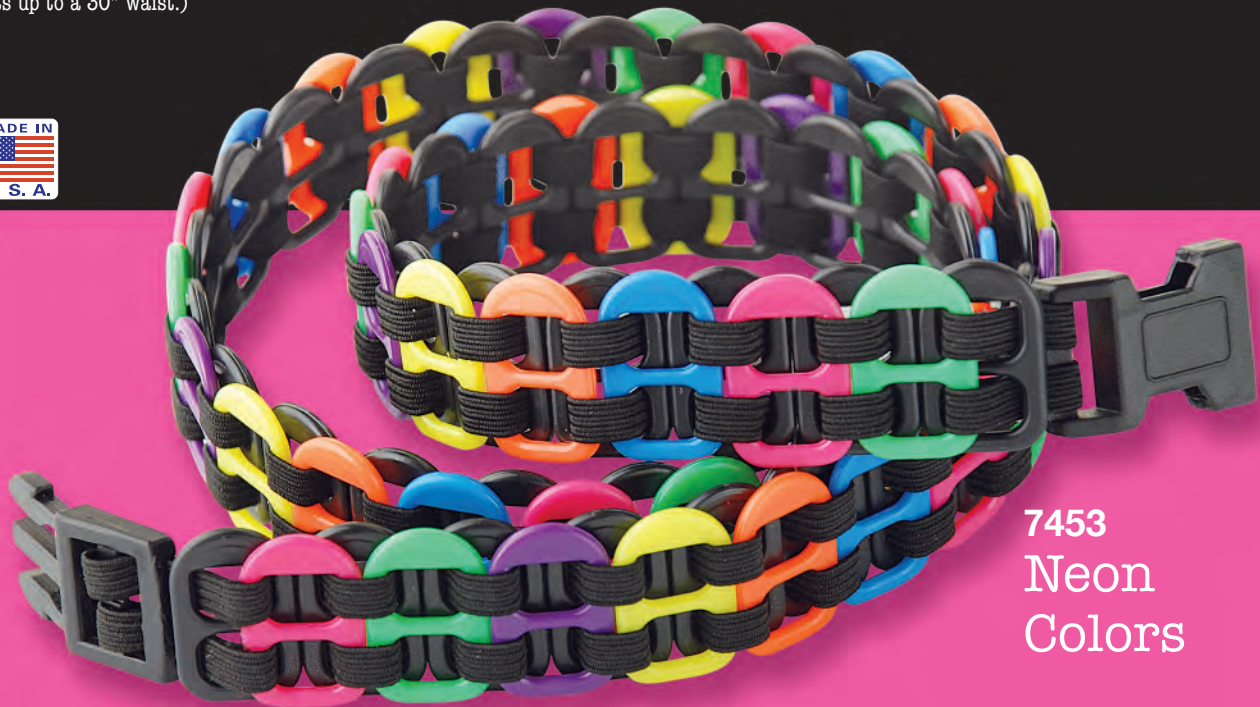
7453 Neon Colors