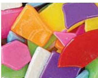
1575SV076 Opaque Multi