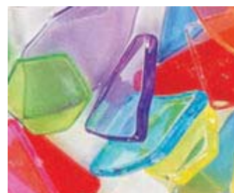
1575SV564 Transparent Multi