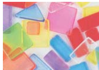
7533SV564 Transparent Multi