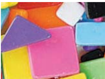
7533SV076 Opaque Multi